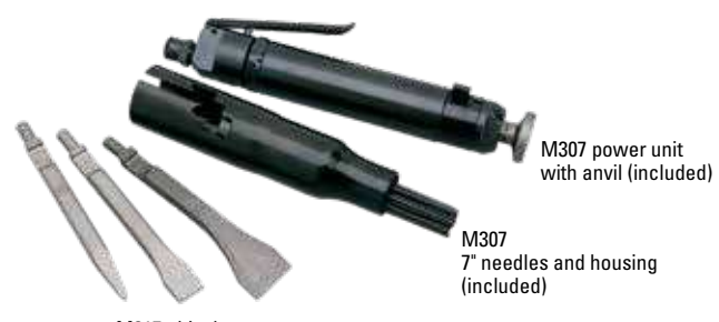
M317 chisels (included in M317 kit, or sold separately)