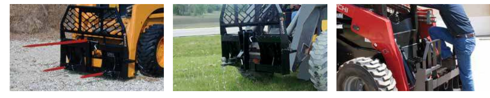
Optional features include an Auger Mount, Bale Spear, & 2" Trailer Receiver Hitch. An additional frame option includes 2" drop height for loaders with oversized tires or tracks over tires is available.