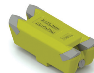
Reversible Carbide Tooth