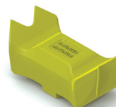
Reversible Claw Tooth