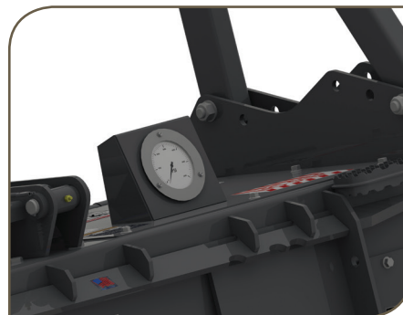
On-board pressure gauge easily viewed from operators station to monitor system pressure (N/A for MM36E and MM60E models)