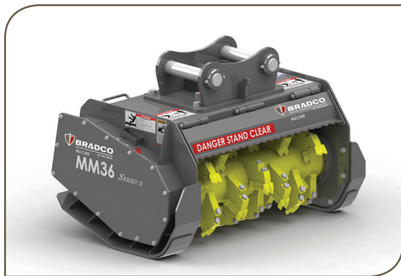
Shown with optional mount