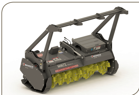
Shown with optional oil cooler