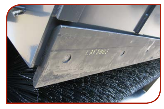
Reversible, heavy duty cutting edge

Additional steel reinforcement/welds between bolts and cutting edge and side plates