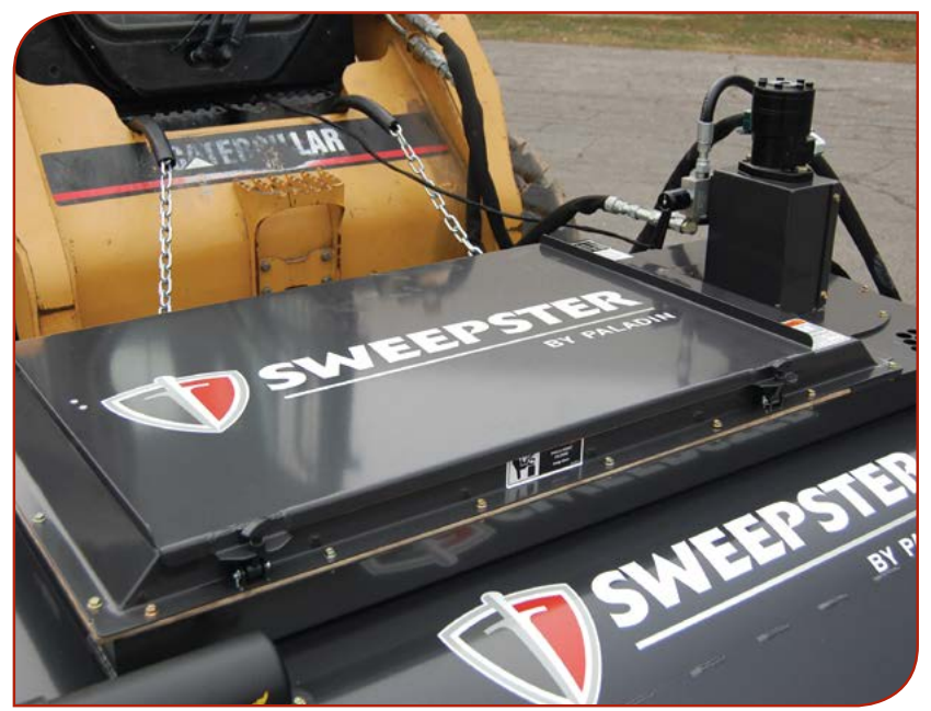
Waterless Dust Abatement Unit