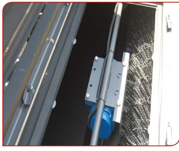
12 volt shaker dislodges loose debris from the filter media directly into the hopper

High volume hydraulic fan pulls air from the sweeping chamber filtering the dust and exhausting clean air