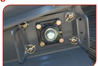
After resting the sweeper on the ground, remove the pins from motor and bearing mounts